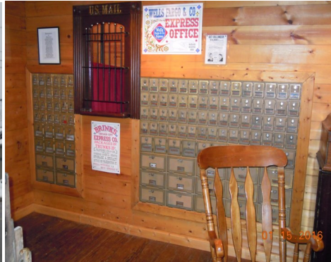
Post Office boxes in Waterford Historic Village