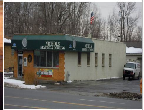
Former Village of Waterford Post Office Building