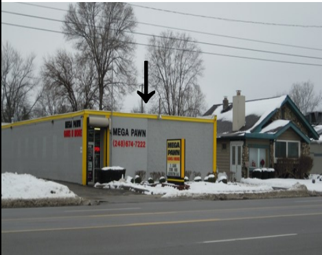
Former Drayton Plains Post Office Building

Two of the photos shown below are of buildings built, after 1940 but before 1960, as post offices for the Village of Waterford and Drayton Plains. They remained separate post offices until they were merged into one (Waterford) in the early 1990s. The other photo shows a bank of post office boxes used before the beginning of home delivery.